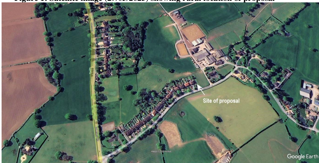
Figure 1: Satellite image (29/05/2025) showing rural location of proposal