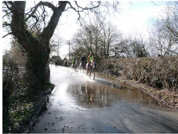
Near entrance to cricket club