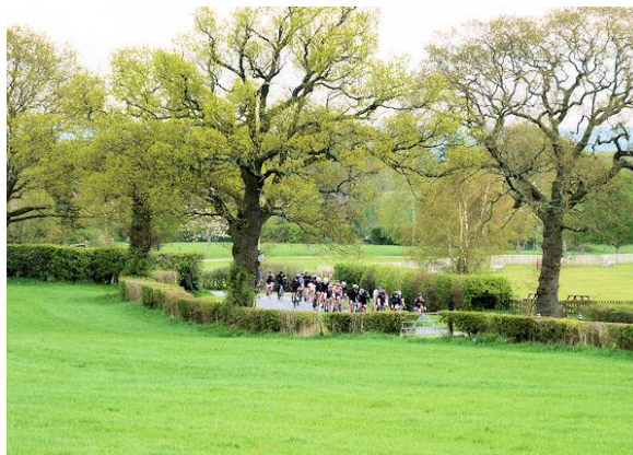
Cyclists near Pear Tree Cottage bend