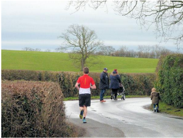
By Pear Tree Cottage bend