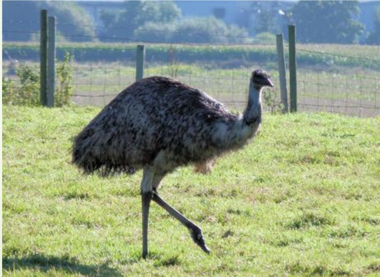
Emu at Bridleway Farm