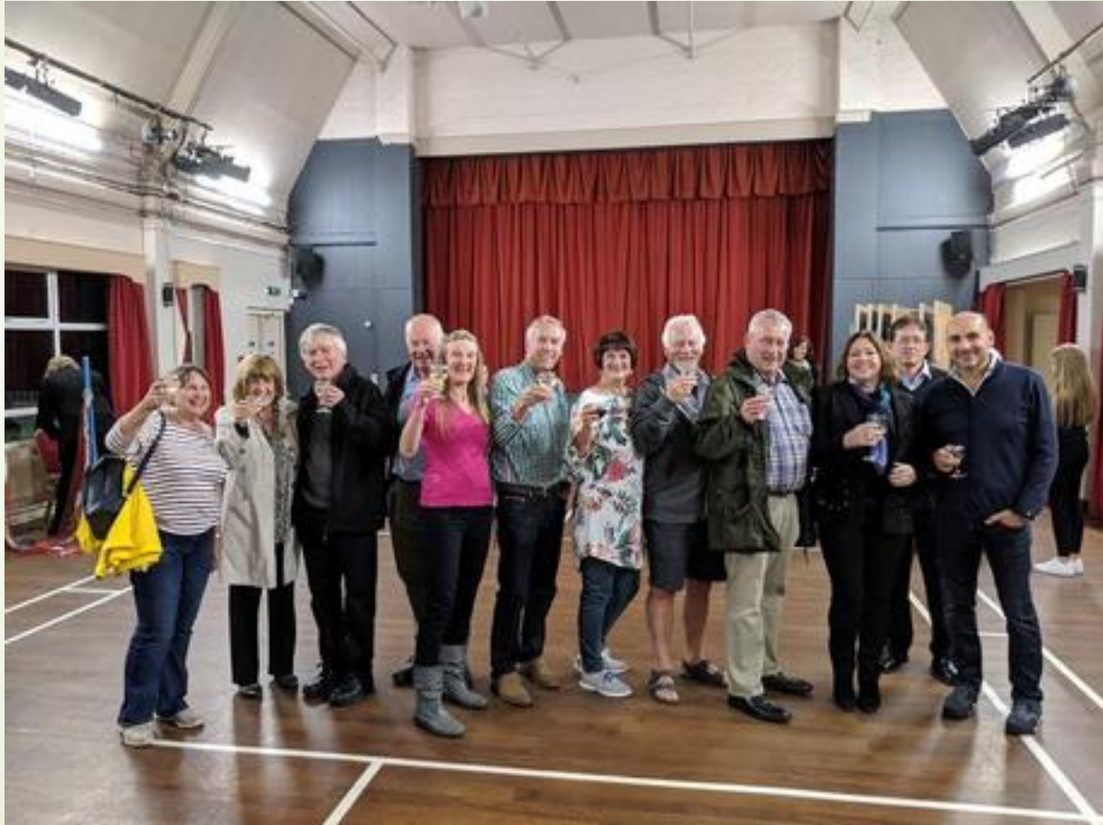
Forum members after the count and declaration