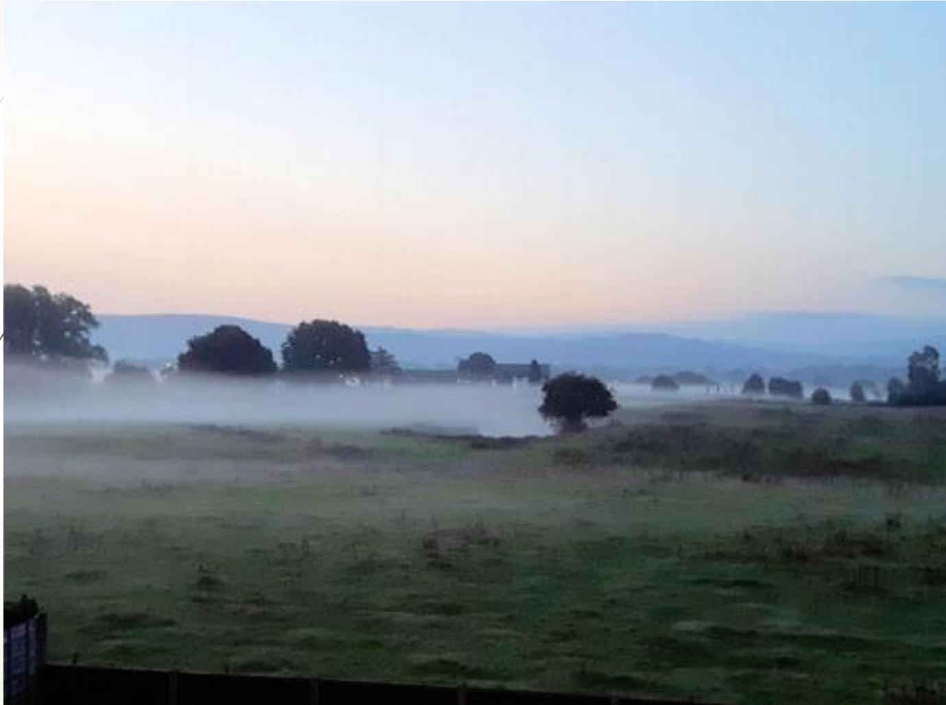
Misty morning from 379 Chester Road