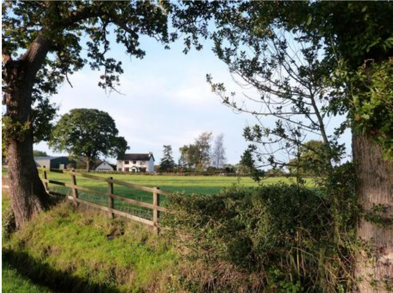
Barr Green Cottage from Church Lane