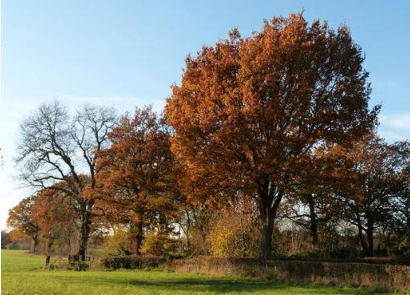
Border of Woodford and Handforth, Blossoms Lane