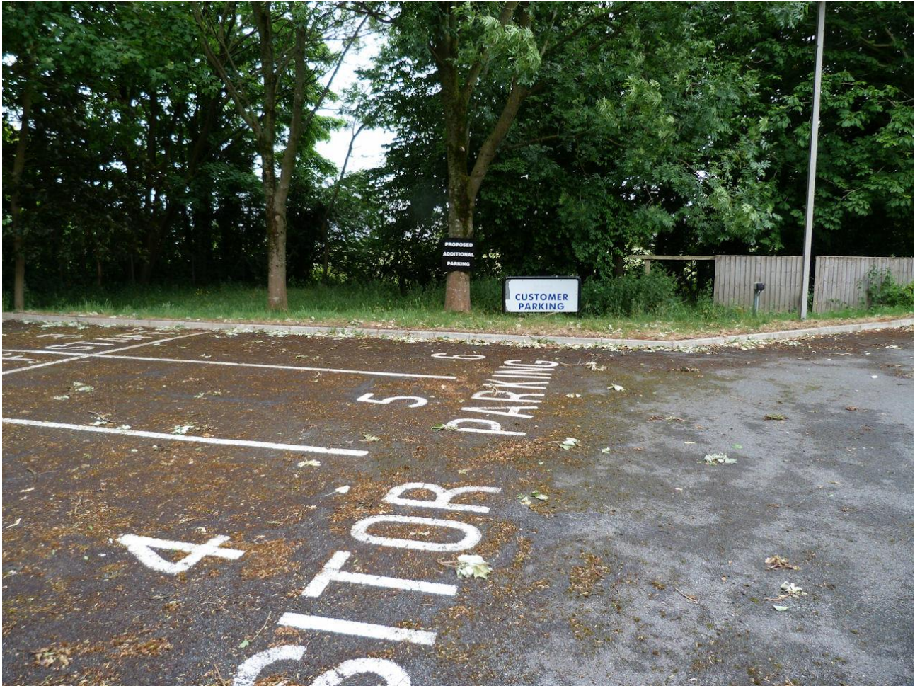
Sign posted on tree reads “Proposed additional parking”