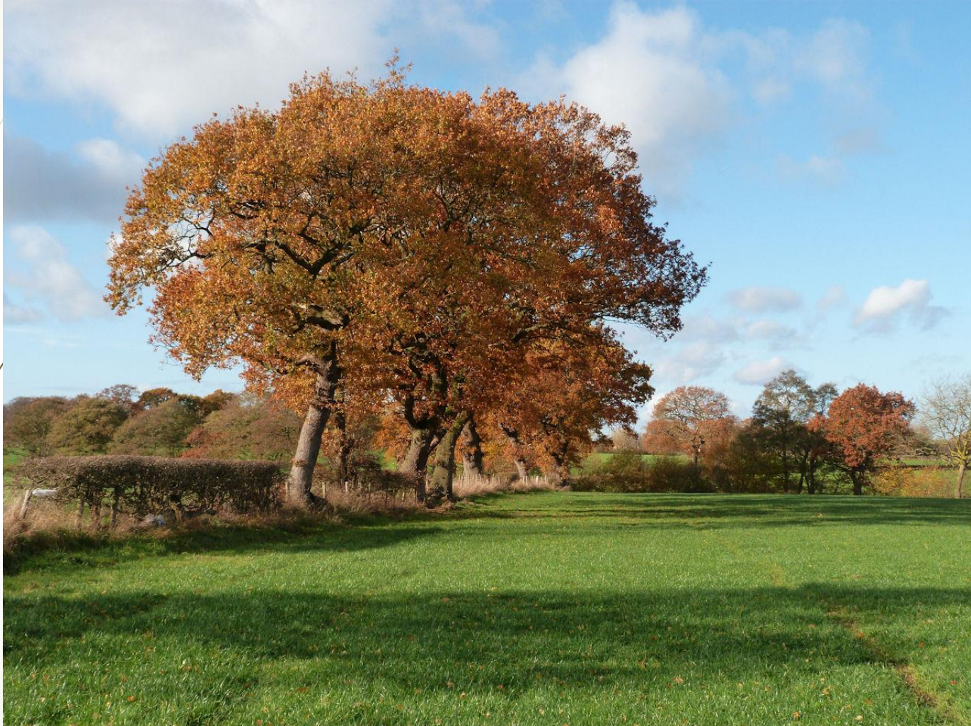
Oak trees on Barr Green Farm