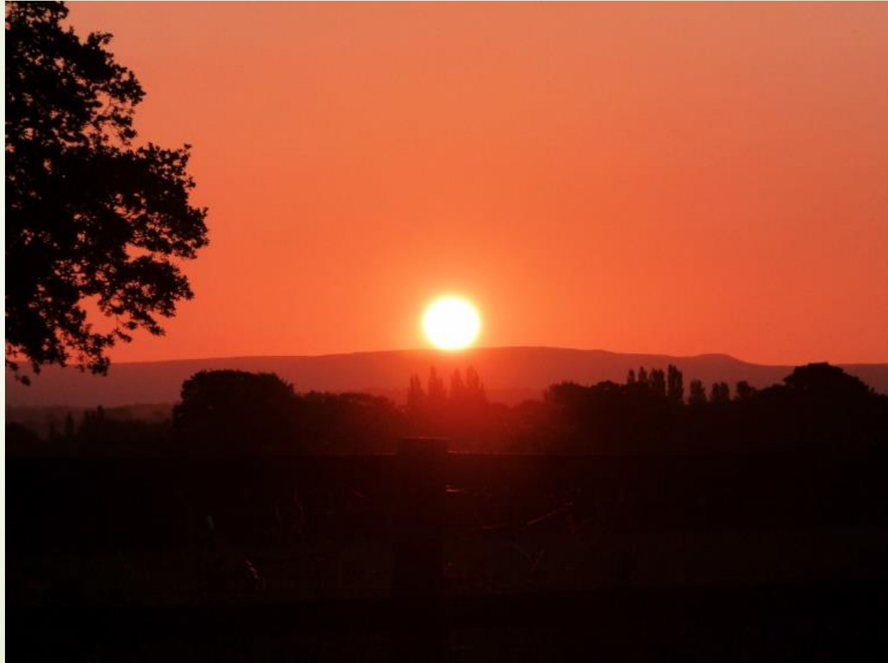
Sunrise in Woodford