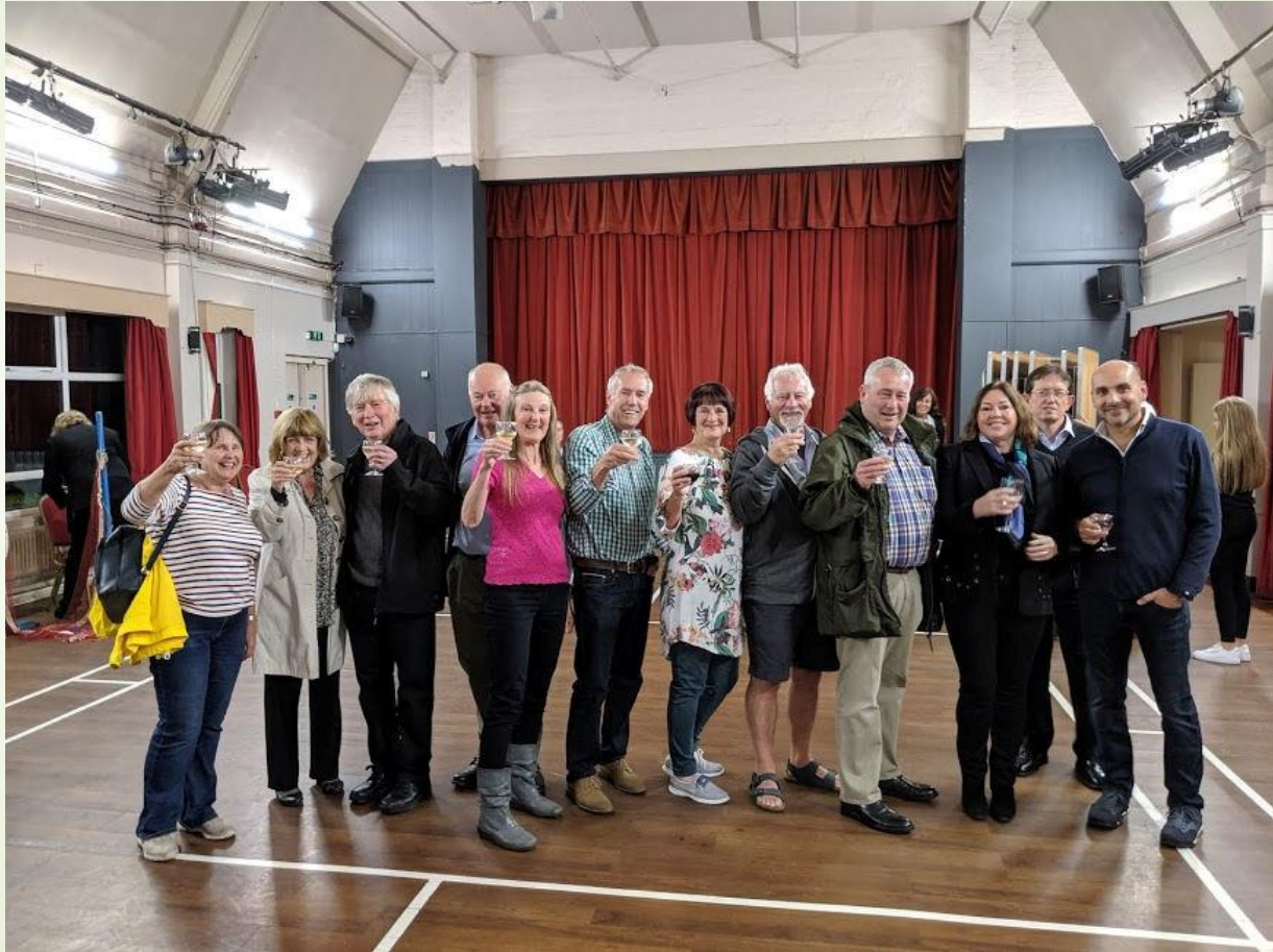
Forum members after the count and declaration