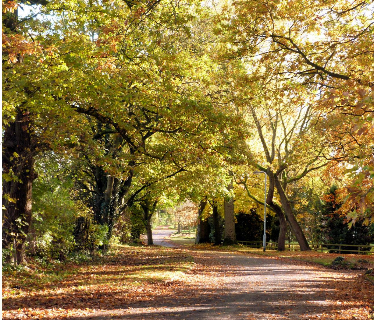
Autumn in Bridle Road